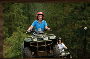
SESSION 3 SATURDAY 1:30-4:30PM