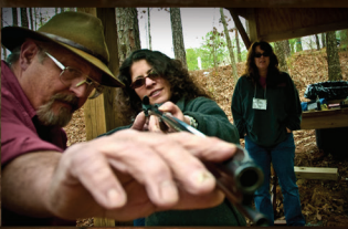
SESSION 1 FRIDAY 1:30-4:30PM