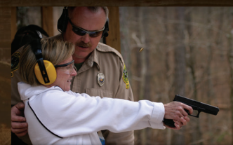
SESSION 4 SUNDAY 8:30-11:30AM