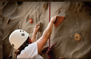
SESSION 2 SATURDAY 8:30-11:30AM